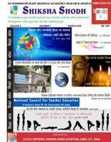
Shiksha Shodh (ISSN-2393-946X)